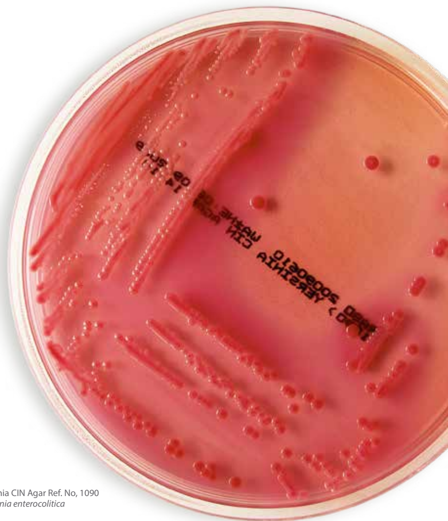
Yersinia CIN Agar Ref. No, 1090 Yersinia enterocolitica